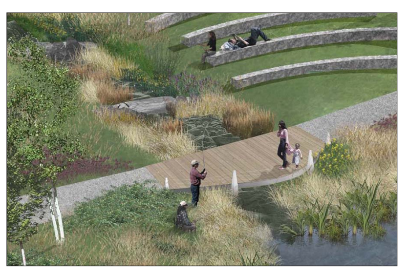
Amphitheater, river overlook boardwalk, and wet meadow at 228th Street