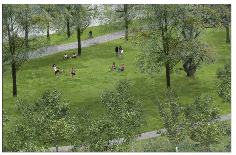
Informal play and relaxation on preserved pastoral lawn

Program Strategies Circulation Stormwater and Floodplain Resource Management Vegetation Management and Restoration Phasing and Implementation