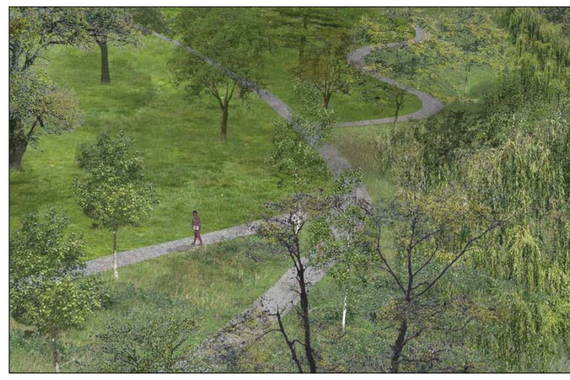
Restored riparian buffer and new system of pathways along the waterfront