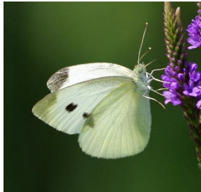
Royal Cabbage Butterfly