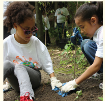
Hands-on experiential learning