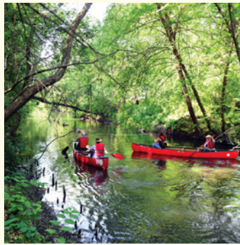
...and again in 2018!