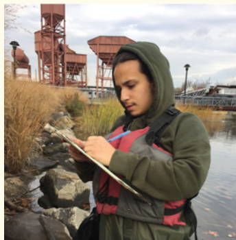
Supporting independent research