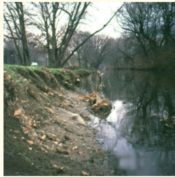
The river at Shoelace Park in 1999

The Bronx River Conservation Crew opens opportunities to Bronxites to develop careers in ecological restoration and parkland management. They are to thank for the dramatic improvement of the river!