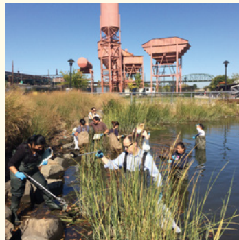
In-field teacher trainings

Today's youth will steward the river over the long term. Our Education Program opens up the river as an outdoor classroom for students and teachers for real-world inquiry.