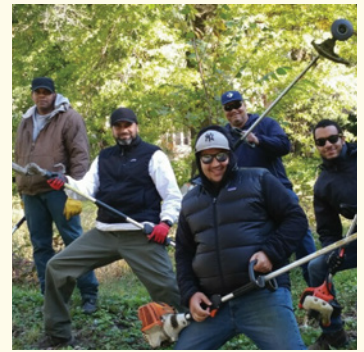
The Crew in action

Since 2001, the Conservation Crew's accomplishments include: