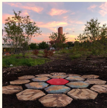
Bronx Native by Lovie Pignata at Concrete Plant Park