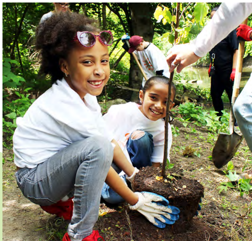
Community youth plant trees along the Bronx River.

Bronx Borough President's Office Mayor's Office of Sustainability Mayor's Office of Recovery & Resiliency New York City Community Boards: 2, 6, 9, 11, 12 New York City Department of Design & Construction New York City Department of Education New York City Department of Environmental Protection New York City Department of Health New York City Department of Parks & Recreation New York City Department of Transportation New York City Soil & Water Conservation District New York State Office of the Attorney General New York State Department of Environmental Conservation New York State Department of Transportation Westchester County Department of Parks, Recreation, and Conservation Westchester County Department of Planning