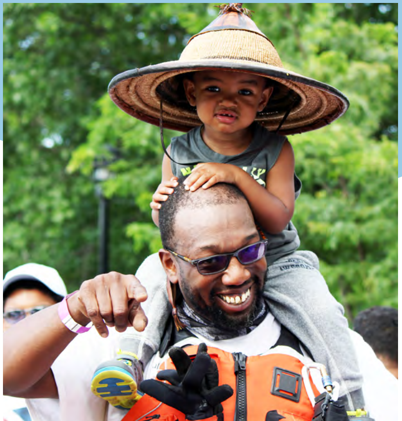
Bronx River Alliance helps foster a life-long love of the outdoors as well as community service.