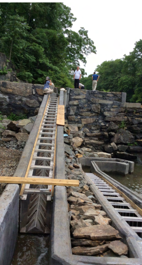
Fish ladder under construction at 182nd Street dam.